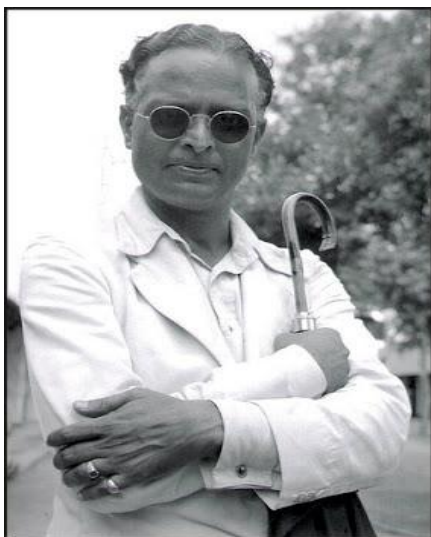
R.K. Narayan (10 October 1906 – 13 May 2001)

Rasipuram Krishnaswamy Iyer Narayan is an Indian literary giant credited with establishing the Indian English novel genre and introducing the Indian sensibility to the world at large. Narayan's literary output was amazing. He wrote fifteen novels, five volumes of short stories, a number of travelogues, non-fiction, English translation of Indian epics, and memoirs. The backdrop of nearly all his fiction is an imaginative town – Malgudi - which grows from a sleepy, dusty, unnoticeable town to a bustling hectic urban centre with the passage of time as the writer adds to this imaginative landscape, novel after novel.